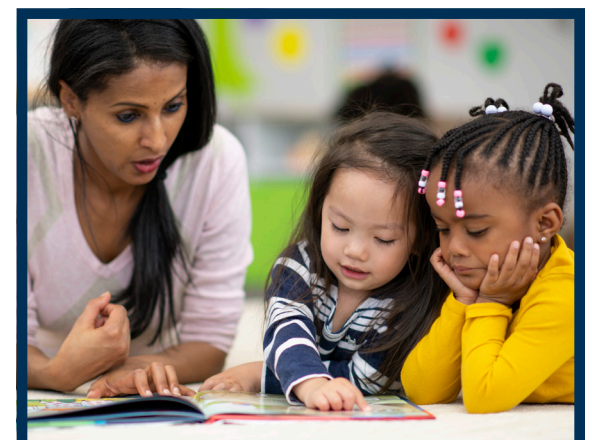
We play house and dress-up. We play with blocks and puzzles.