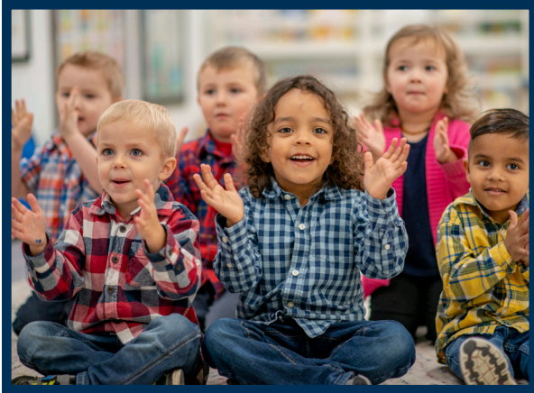
We sing with the teacher and listen to stories.